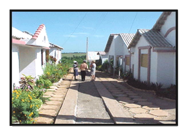
Figure 1. Picture of the Architect of the Community - A Participative Designing Method in Cuba (Source-

The link between Government, NGO. professional and community seems work well, but of community empowerment in cooperation as a group could also lead to sustainable failure. This project only aiming at individual household as client, for this case, household become a weakest part on this link. household Improving the cooperation especially earning money would decrease their depending on the NGO's and government would lead to the community autonomous.