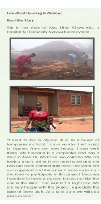
Figure 2. Low-cost housing project in Malawi

The poor, under-educated rural population is increasingly moving into urban centre's looking for work or an improved living standard. Increasing populations are straining cities' abilities to provide basic services - water, sanitation, shelter, education, health care. At the same time rural populations are dwindling, thus lessening the agricultural base and in many decreasing the nation's food stores. These problems could bring a failure to low-cost housing project in Malawi.